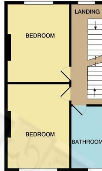
1ST FLOOR APPROX. FLOOR AREA 368 SQ.FT. (34.2 SQ.M.)