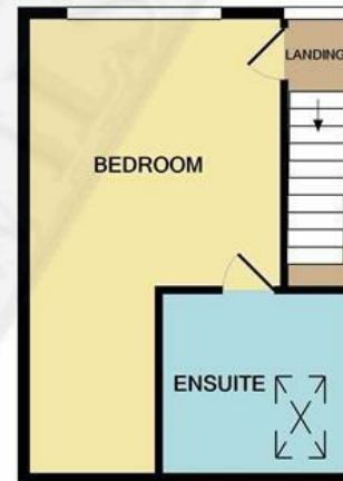
2ND FLOOR APPROX. FLOOR AREA 249 SQ.FT. (23.1 SQ.M.)

TOTAL APPROX. FLOOR AREA 1056 SQ.FT. (98.1 SQ.M.)