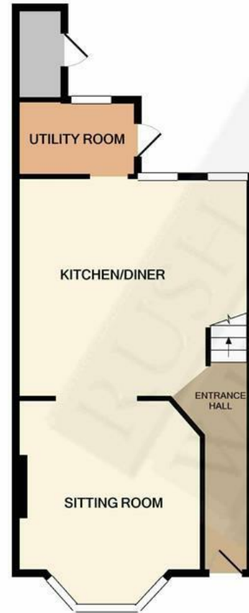
GROUND FLOOR APPROX. FLOOR AREA 440 SQ.FT. (40.8 SQ.M.)